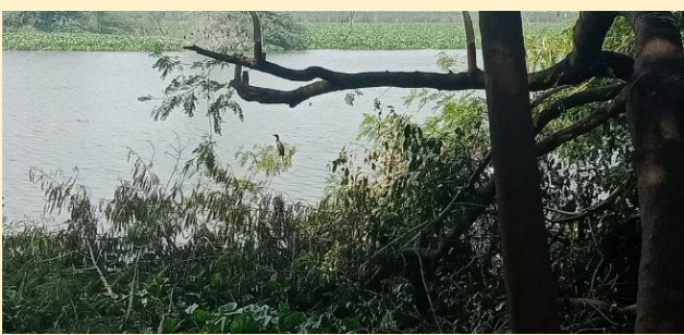
Mobile Photography - Okhla Bird Sanctuary