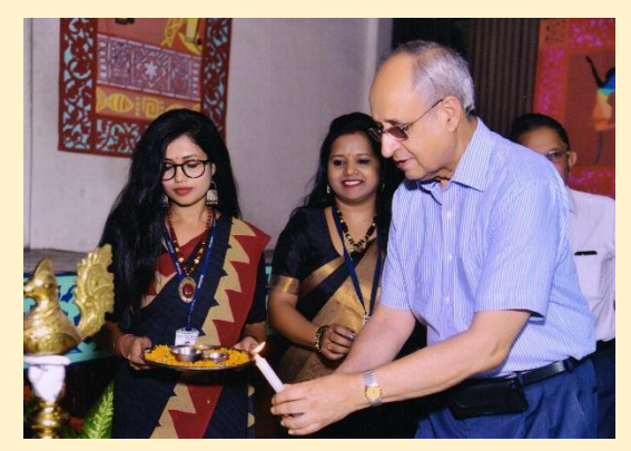
Lighting the lamp - Annual Day